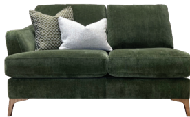
W- 151cm H- 87cm D- 103cm