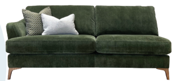
W- 202cm H- 87cm D- 103cm