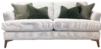
W- 196cm H- 87cm D- 103cm