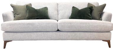
W- 220 cm H- 87cm D- 103cm