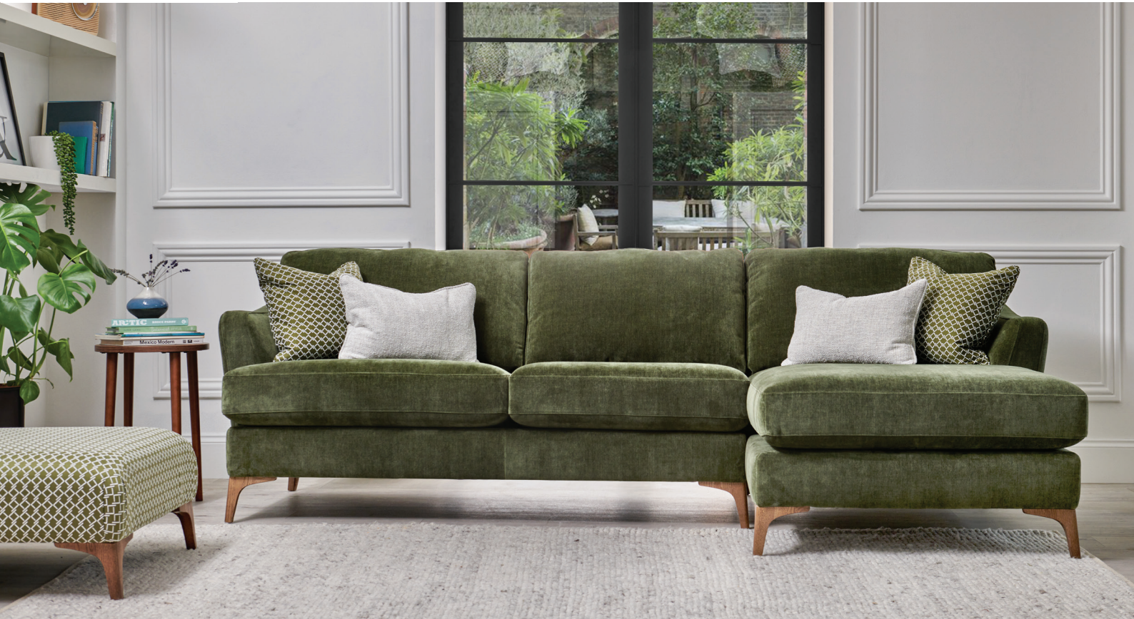
Image shows Left Hand Facing 2.5 seater with a Right Hand Facing Chaise in Manhattan Conifer with Smoke wood feet