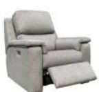
Recliner Armchair with Headrest & Lumbar (Power)