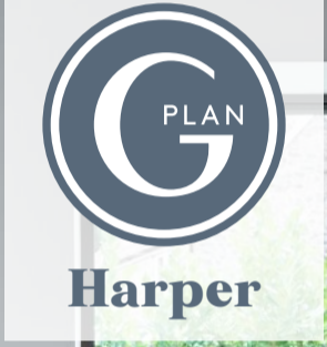
Cover photo shown in: Texas Charcoal and Cambridge Chalk

www.gplan.co.uk WEB @gplandesign @gplandesign @gplandesign @designbygplan