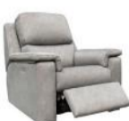
Recliner Armchair (Manual/Power)