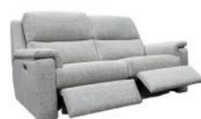
Large Double Recliner Sofa with Headrest & Lumbar (Power)