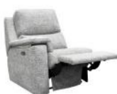
Small Recliner Unit with Headrest & Lumbar (LHF/RHF)(Power)