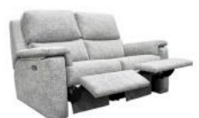
Small Double Recliner Sofa with Headrest & Lumbar (Power)