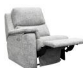
Small Recliner Unit (LHF/RHF)(Manual/Power)