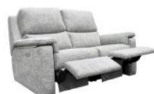
Small Double Recliner Sofa (Manual/Power)